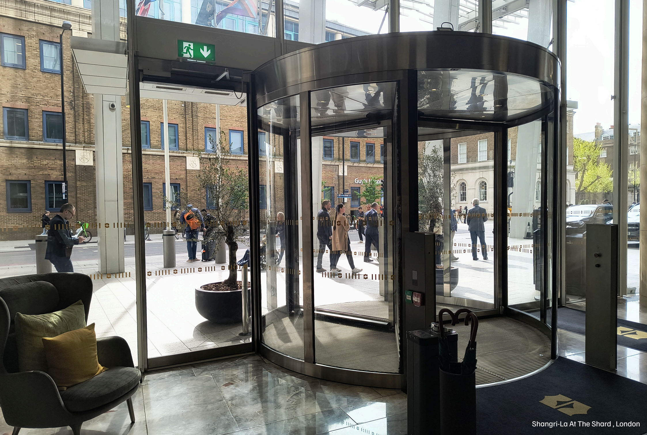
Shangri-La At The Shard , London