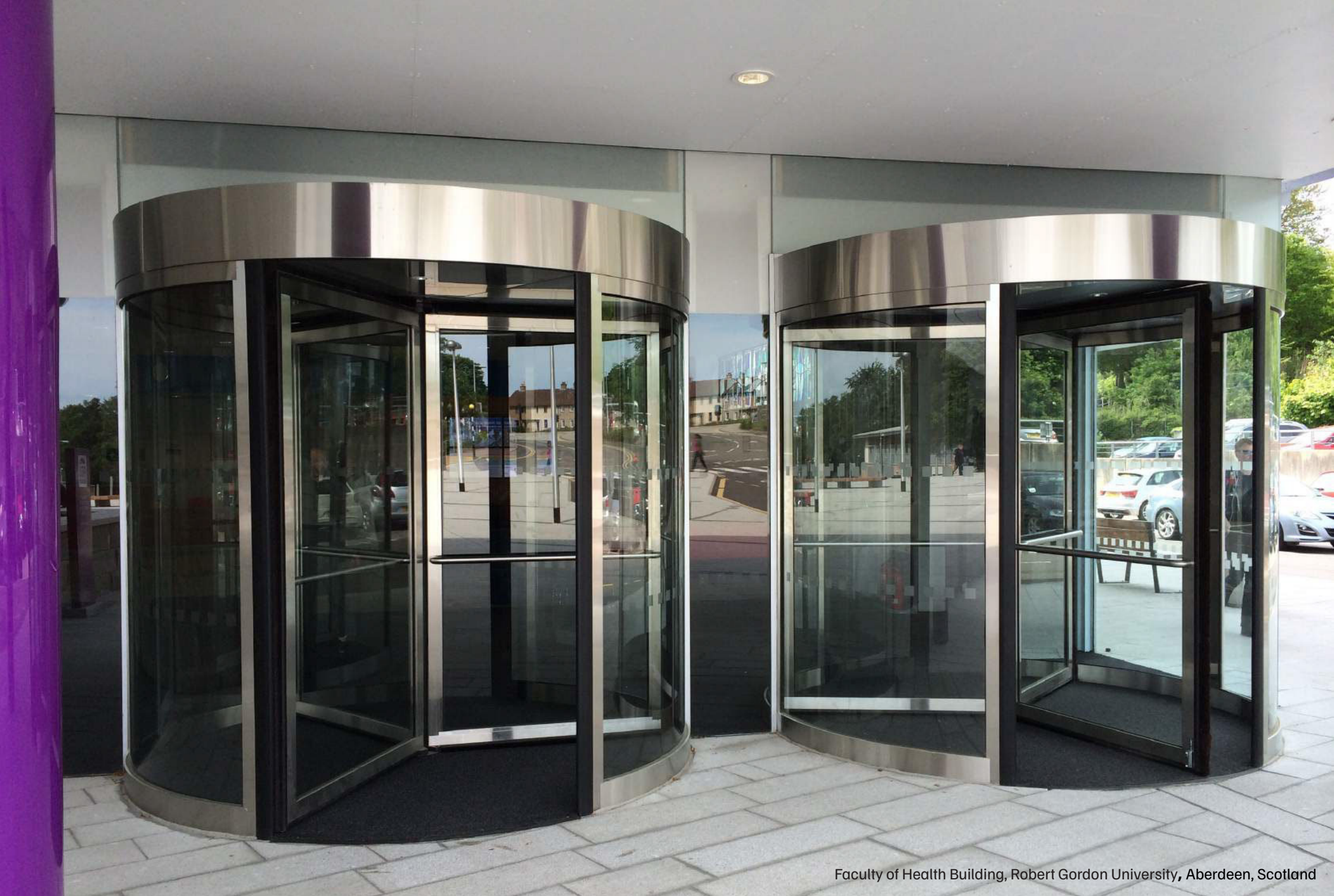
Faculty of Health Building, Robert Gordon University, Aberdeen, Scotland